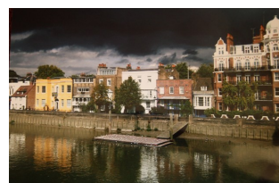
By Cassius (Oak)

It was incredibly difficult judging the photo challenge. The 5 winners were