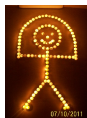
By Leon (Y5)