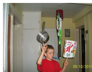
By Warren Brierly (Parent)

Do check out the photo book in the lobby to see all the fantastic entries. Well done to everyone that entered.