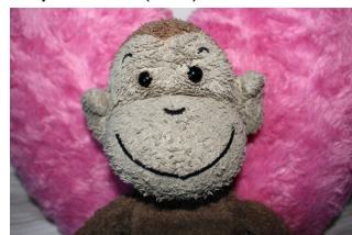
By Emily ~(Beech)